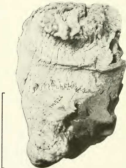
Fig. 3. Lateral surface, right side, PM 526. Rostral direction toward right. Line represents 10 cm.